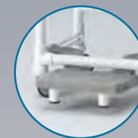
FR Slide-out footrest, anti-tip design, stays on chair, easily glides back and forth