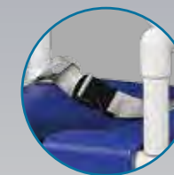
AT Anti Tip