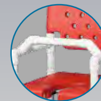
LB Lap bar