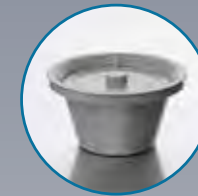
P Pail with inside scale to measure fluid, this option has to be ordered with the seat, otherwise there will be no rails.

Anyone of these options can be added to the Basic models ELT 817 (17") or ELT 820 (20") clearance over a toilet.